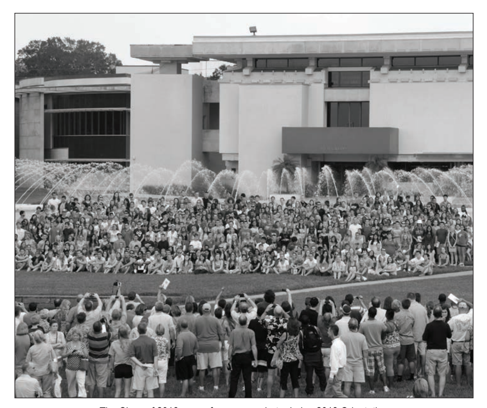
The Class of 2016 poses for a group photo during 2013 Orientation

In regard to academic information, this edition of the Florida Southern Academic Catalog supersedes all others. The faculty and trustees of Florida Southern College reserve the right to change, modify, revoke, or add to the College's academic, financial, or student requirements or regulations at any time and without prior notice. All such changes are effective at such times as the proper authorities determine and may apply not only to prospective students but also to those who already are enrolled in the College. Provisions of this Catalog do not constitute an irrevocable contract between any student and the College.