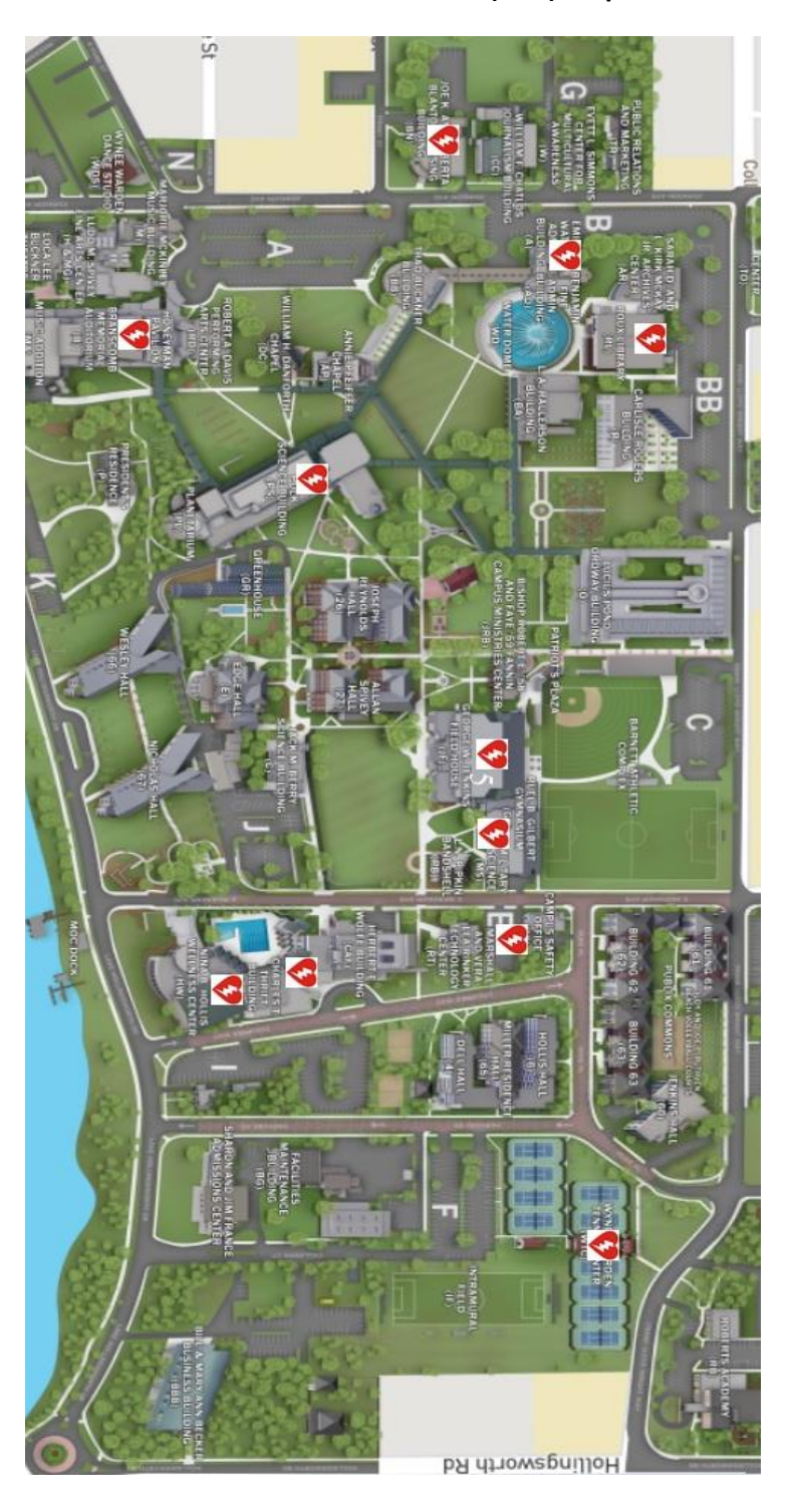
Appendix F Automated External Defibrillator (AED) Map