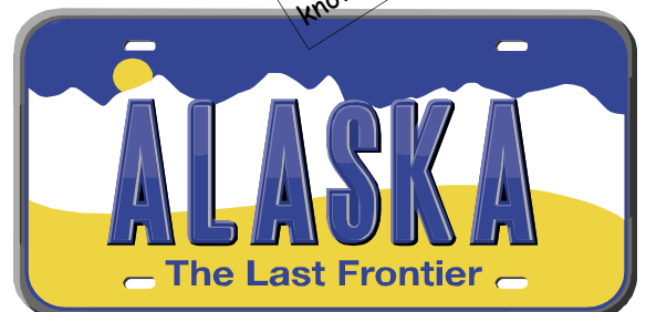
What do you know about Alaska? What resources do they have?

You might use the idea on vocabulary above to navigate through the content effectively.