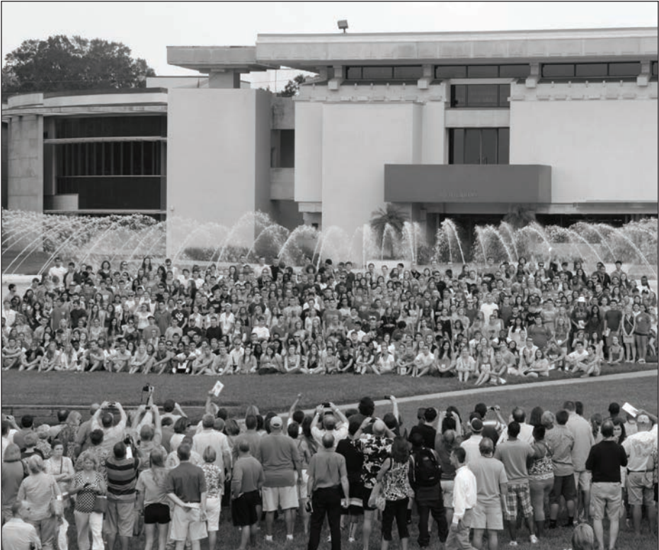
The Class of 2016 poses for a group photo during 2013 Orientation

In regard to academic information, this edition of the Florida Southern Academic Catalog supersedes all others. The faculty and trustees of Florida Southern College reserve the right to change, modify, revoke, or add to the College's academic, financial, or student requirements or regulations at any time and without prior notice. All such changes are effective at such times as the proper authorities determine and may apply not only to prospective students but also to those who already are enrolled in the College. Provisions of this Catalog do not constitute an irrevocable contract between any student and the College.