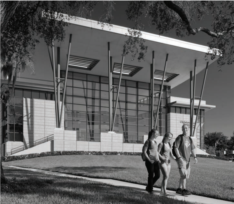
Dr. Marcene H. and Robert E. Christoverson Humanities Building

Family Policy Compliance Office, U.S. Department of Education 400 Maryland Avenue, SW, Washington, DC 20202